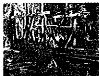
Savoonga Campsite Shelter Work - 2014

The Lost Lake Work Weekend is set for May 29-30. The Council will provide breakfast and lunch. Lists of projects and fun things to do are being prepared. You can stay at any of the cabins or sites, first come first served. You may