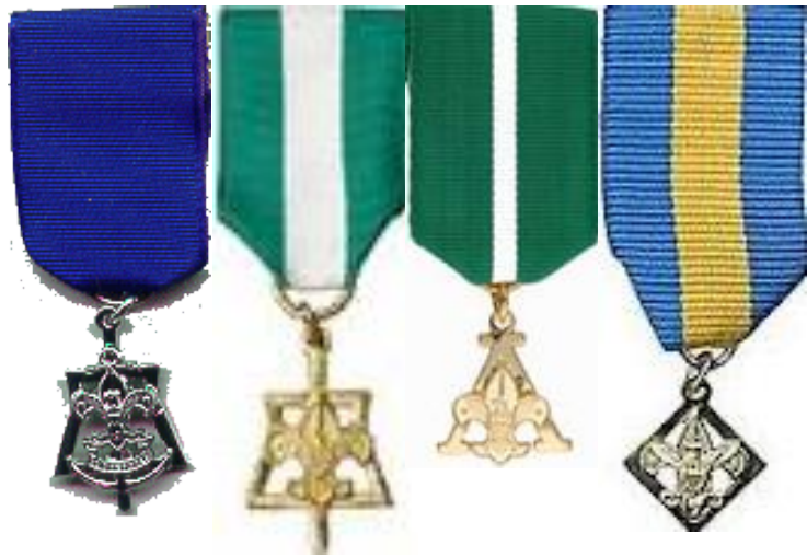
Current Scouter Award Medals

Skipper's Key Scouter's Key STA DLTA 1942-P 1940-P 1956-P 2013-P