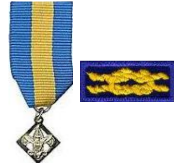
Den Leader's Training Award

Eligible: All scouters. Requirements: Varies, use 2012 editions; 2 years tenure. Insignia: Medal, square knot, certificate. Approval Level: District Details: The award may be earned many times, but only once per discipline.