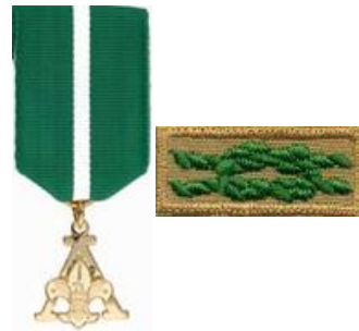
Scouter's Training Award

Eligible: All scouters in key positions. Requirements: Varies, use 2012 editions; 3 years tenure (4 for skippers). Insignia: Medal, square knot, certificate. Approval Level: District Details: The key may be earned many times, but only once per discipline. Skipper's Key recipients may wear the alternate medal.