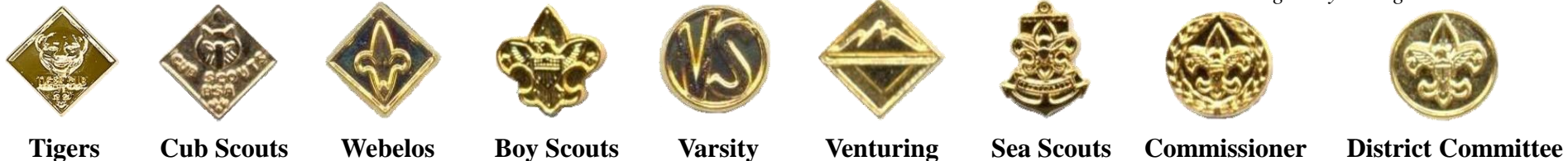
Tigers Cub Scouts Webelos Boy Scouts Varsity Venturing Sea Scouts Commissioner District Committee

Devices greatly enlarged to show detail.