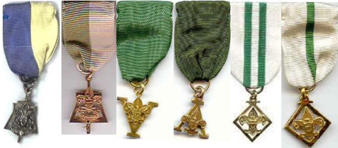
Former Scouter and Cub Scouter Award Medals (1939-1988)

Skipper's Key Scouter's Key STA DLTA 1942-P 1940-P 1956-P 2013-P