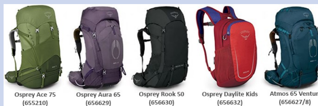
Osprey Ace 75 (655210) Osprey Aura 65 (656629) Osprey Rook 50 (656630) Osprey Daylite Kids (656632) Atmos 65 Venturi (656627/8)

Osprey Backpacks Available NOW via order from BSA National Supply. Contact the Scout Shop for