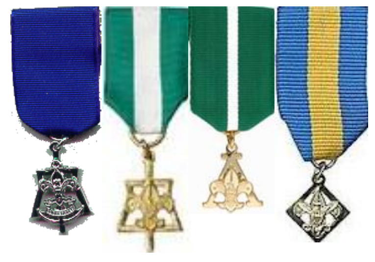
<u>Current Scouter Award Medals</u> Skipper's Key Scouter's Key STA 1942-P 1940-P 1956-P