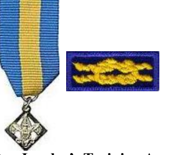
Den Leader's Training Award